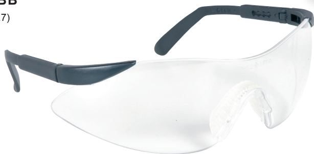
EVA86 / EVA86AB (EN170: 2C-1.2)